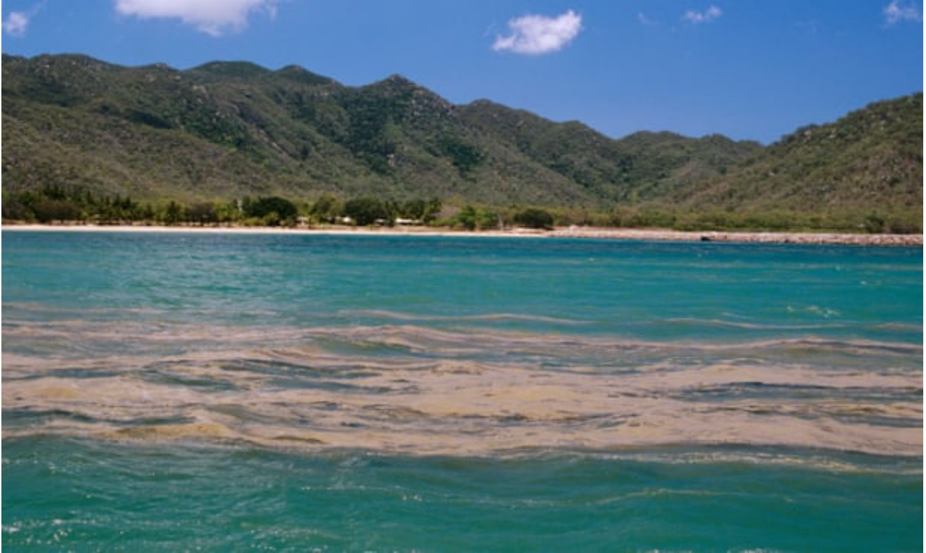
Algal blooms are a rapid increase in the population of algae in an aquatic system.

Scientists uncover secrets of 30-mile 'slow-cooked' cluster in South Pacific Ocean